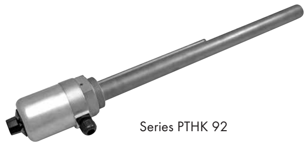
Series PTHK 92