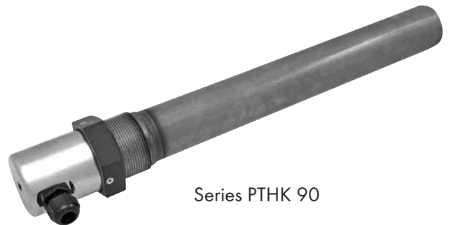
Series PTHK 90