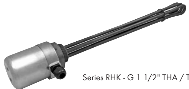
Series RHK - G 1 1/2" THA / THI