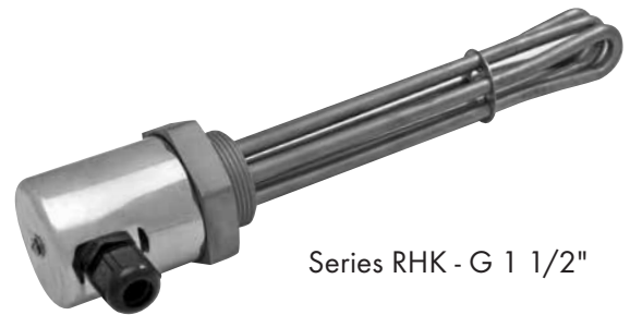
Series RHK - G 1 1/2"